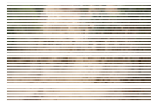
Села Сангистон, Зоосун, Томин и Путхин