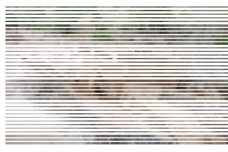
Sangiston, Zoonsun, Putkhin and Tomin villages